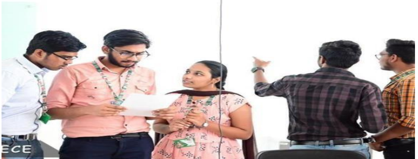
Students participating in the AWR Event