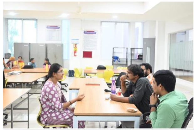
Faculty Conducting Reviews to students