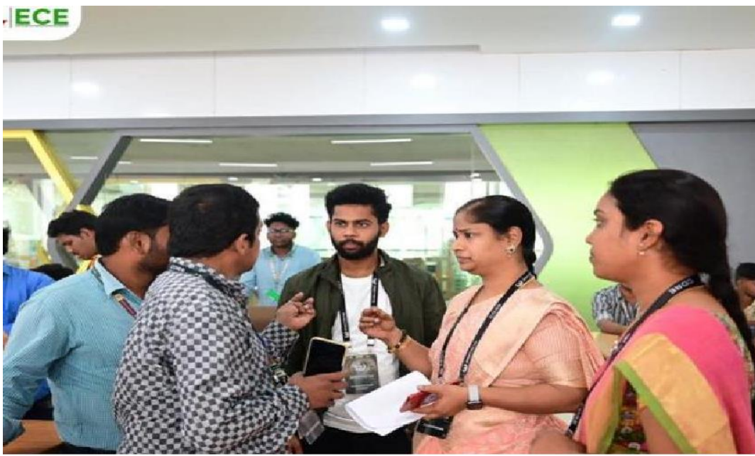
Faculty giving suggestions to the event co-ordinators

In the below pictures we made the students as a groups as their wish and give a troubleshoot to solve it, meanwhile faculty came to take part in it. The pictures are representing the review sessions going on in the event where the students are awarded with marks